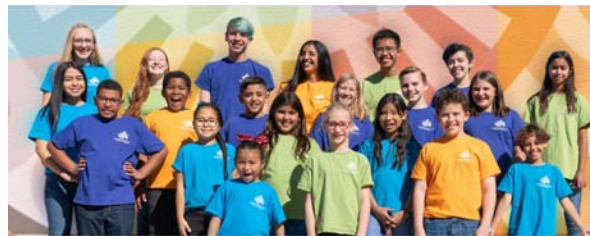
Members of the Denver Children's Choir.

The Delta Omicron Foundation has made donations to three youth-oriented musical organizations to continue its Musical Pathways for Youth project. This year's recipients included the Denver Children's Choir in Colorado, the Tune-Up Philly program in Pennsylvania and the San Diego Youth Symphony in California.