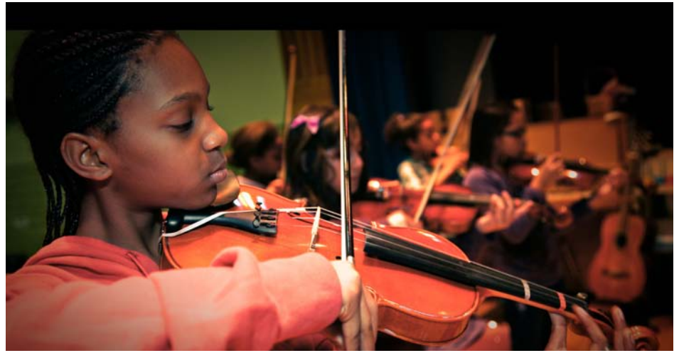
The Colorado Youth Symphony’s Mile High Strings Outreach Program gives over 600 children their first experience playing an instrument, and teaches discipline, creativity, teamwork, respect for achievement and an appreciation of excellence.

With that gift, the Delta Omicron Foundation was able to award one-time grants to three Denver area arts organizations. The grants were directed to area music education programs that impact Title I schools and students in Denver. The programs either provide music programming