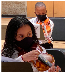
Players in the Progressions Program in the Milwaukee Youth Symphony Orchestra.

The Progressions Program of the Milwaukee Youth Symphony Orchestra, a part of MYSO's innovative