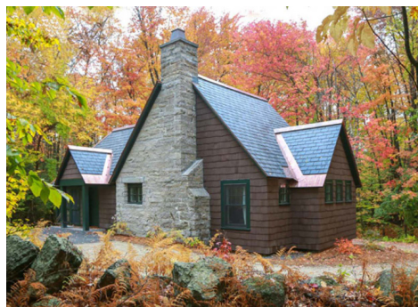
The renovated Delta Omicron Studio at the MacDowell Colony in Peterborough, N.H.