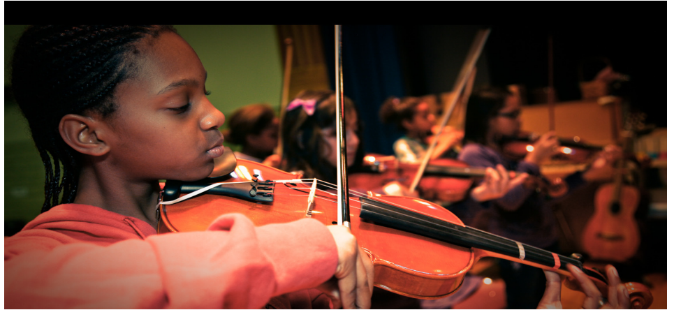
The Colorado Youth Symphony's Mile High Strings Outreach Program gives over 600 children their first experience playing an instrument, and teaches discipline, creativity, teamwork, respect for achievement and an appreciation of excellence.

Chapter of Delta Omicron at the University of Northern Colorado in 1935.