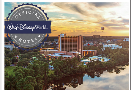
Wyndham Lake Buena Vista Lake Buena Vista, Florida